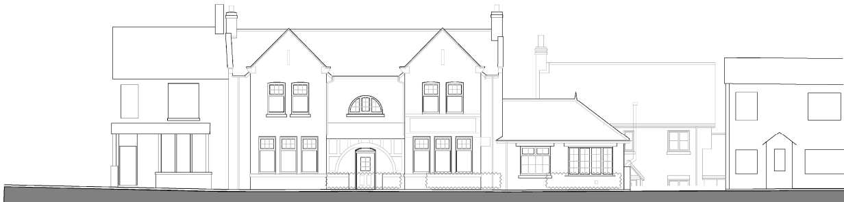
PROPOSED THORPE ROAD CONTEXT ELEVATION