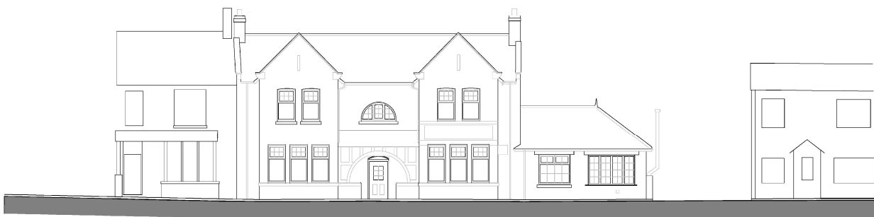
EXISTING THORPE ROAD CONTEXT ELEVATION